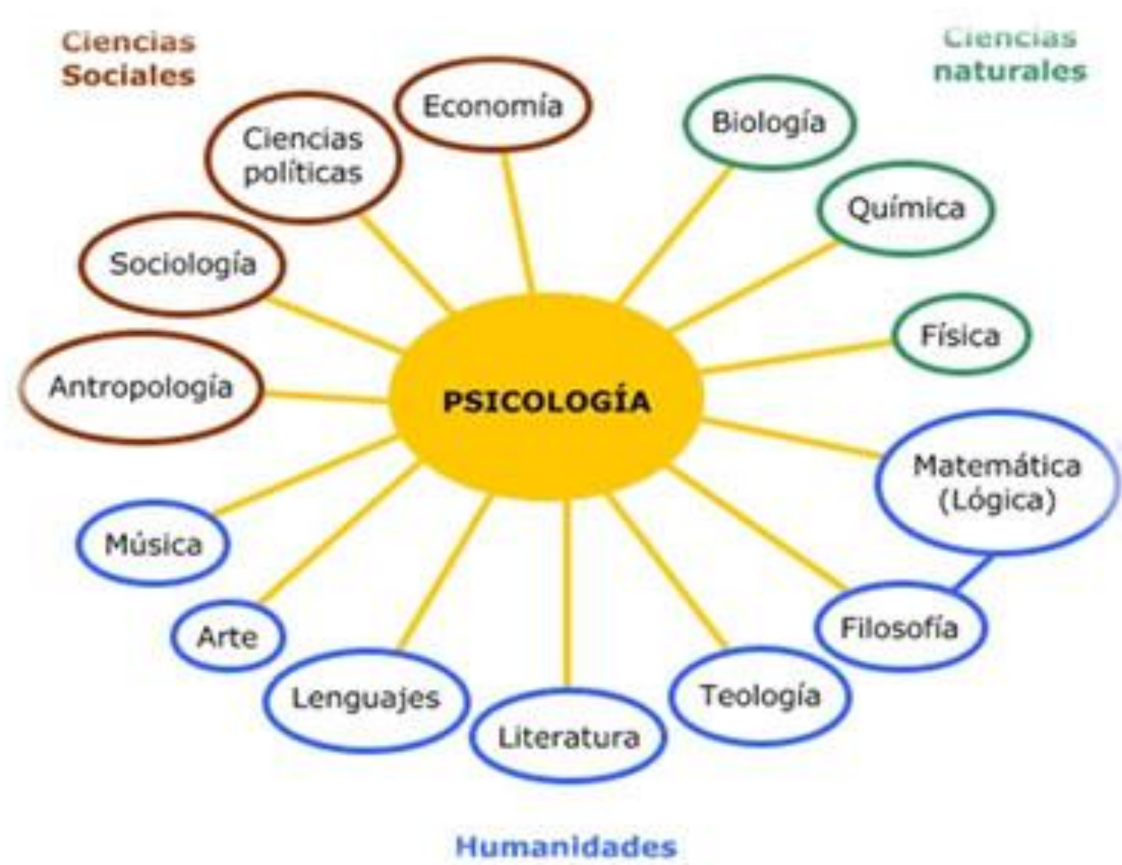
Figure 1: Psychocentric theory of the university

The program included the development of a Psychology is STEM website, a distinguished speaker symposium, experiential demonstrations, and the development of a Psyc Is STEM app. Prior to program implementation, the Perception of Psychology as a Science scale was administered to students taking introductory science courses.